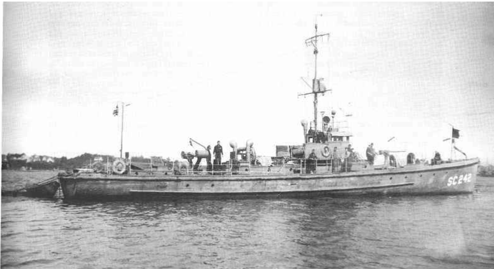
SC 242 - One of the six 110-foot wooden American submarine chasers that operated under RCN control in May-November 1918. SC 242 was part of the division that ran fast escort missions from Sydney. In addition to a stern depth charge chute, she carried a "Y" gun, which can be clearly seen on the quarter deck, to fire charges off both beams. Forward is a 6-pounder quick-firing gun.